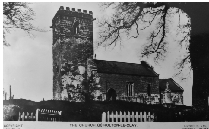
COPYRIGHT HL CL 8. THE CHURCH (B) HOLTON-LE-CLAY. LILYWHITE LTD TRIANGLE - HALIFAX