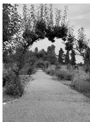
Pear tree archway and a carved horse and rider

The courtyard café serves a variety of cakes and snacks, as well as plated meals. Off the courtyard are a couple of exhibits you can roam into; of carriages and the work of George Stubbs, the equine artist. Dogs are welcome in the grounds Too!