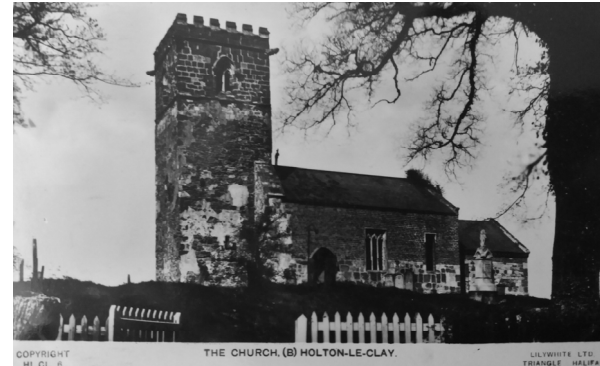
COPYRIGHT H.L.C.L. 8 THE CHURCH. (B) HOLTON-LE-CLAY. LILWHITE LTD TRIANGLE - HALIFAX