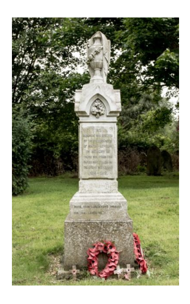
The War Memorial in the churchyard of St. Peter's Church

The village has a Grade 2 listed brick and stone Anglican Church, St Peter's. It has a chancel, nave, and an embattled tower with 3 bells. The tower, chancel and nave arch are of Saxon or of very early Norman origin. Within the churchyard is a 14th-century cross base and shaft and a war memorial. The Church was partly restored in brick during the Nineteenth Century. Holton-le-Clay is also recorded as having a Wesleyan chapel in 1827 and Primitive Methodist in 1836.