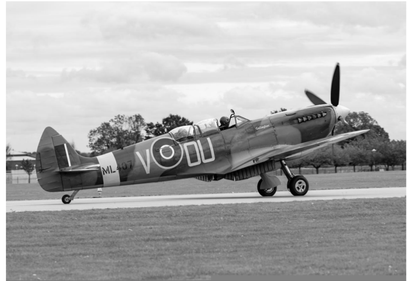
Battle of Britain Day 15 th September