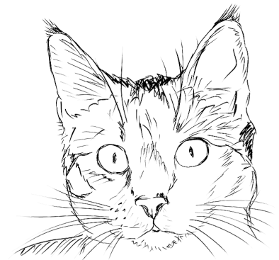
Colour in the Cat